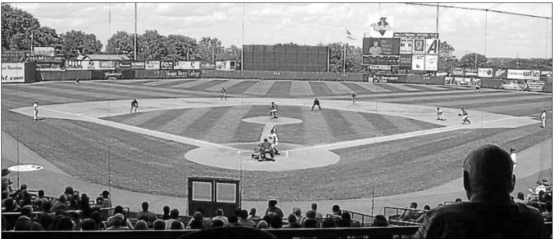
Veteran's Memorial Stadium in Cedar Rapids, Iowa, is home to the Cedar Rapids Kernels, the Twins Class A affiliate.